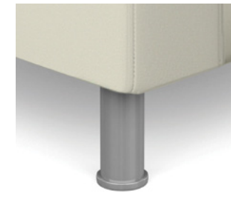
Metal 1.5" Pole, Silver Powder Coat