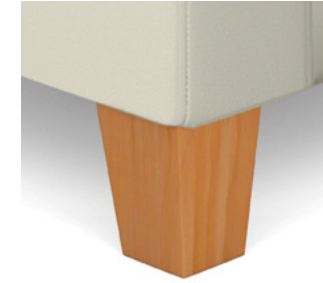
Wood Tapered Square