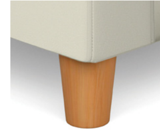
Wood Tapered Cylinder