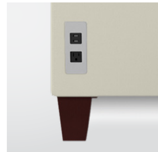
Power (black, silver)