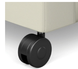
Non-Locking Caster, Black