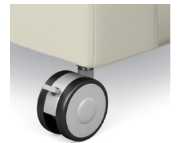
Silver (Non-locking + Locking)