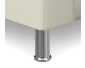
Metal 1.5" Pole, Brushed Aluminum