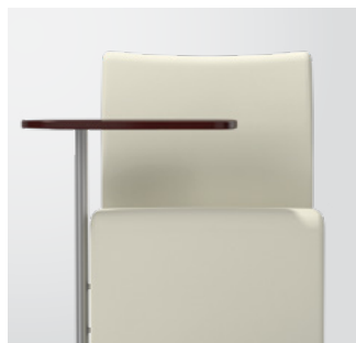
Tablet Arm (black, silver)